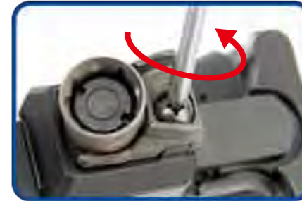
Loosen the rear sight fixing screw and turn the adjusting screw with a screwdriver.