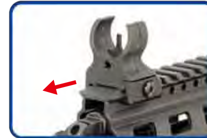
Remove front sight.