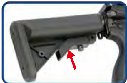
Press the stock release lever to unlock.