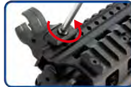
Unscrew the screw to disassemble the front sight.