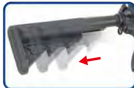
Adjust the position ( 6 position ).