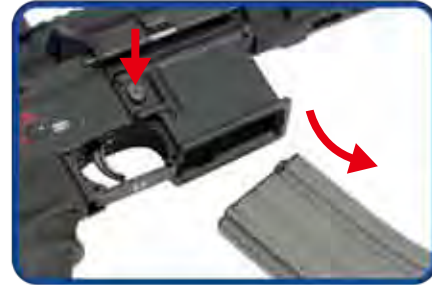
Remove the magazine.