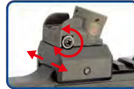
Windage Adjustment (left / right adjustment)