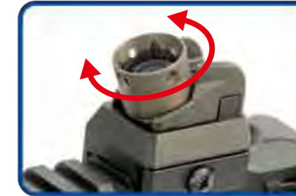
Turn for adjustment. Use the small hole for precision shooting.