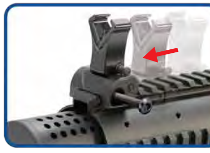
Turn the screw counterclockwise to take off the screw and remove the sight.

PARTS LIST FFR 01 Sling Swivel FFR 02 Rear Sight FFR 03 Flip-up Front Sight FFR 04 Charging Handle Set FFR 05 Upper Receiver Set FFR 06 Stock Set FFR 07 Lower Receiver Set FFR 08 Hop Up Set For FFR 7" FFR 09 Rail System Set For FFR 7" FFR 10 SuppressorHop Up Set For FFR 7" FFR 11 Outer Barrel Set For FFR7" FFR 12 Mock Flash Suppressor For FFR12" SD FFR 13 Rail System Set For FFR 12" SD FFR 14 SuppressorHop Up Set For FFR 9" Sales Dept. | sales@guay2.com , b2b@guay2.com