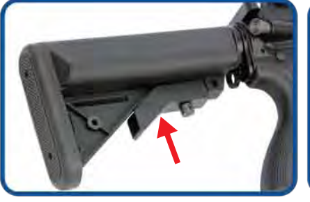
Press the stock release lever to unlock.