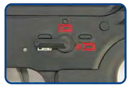
Semi Auto Single shot