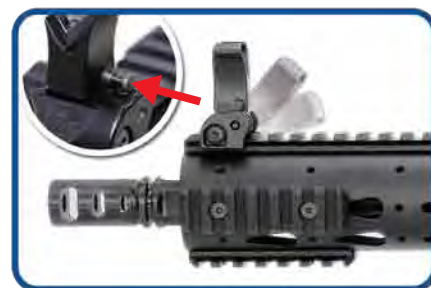
Hold down the button to fold the rear sight and Front sight.