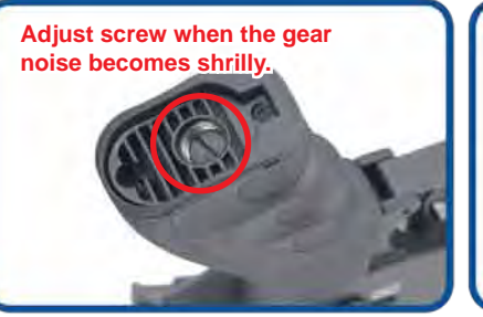
The screw at bottom of the grip. Please use the screwdriver to adjust.