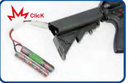
Connects the battery until connector clicks into place.