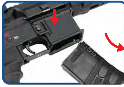
Remove the magazine.