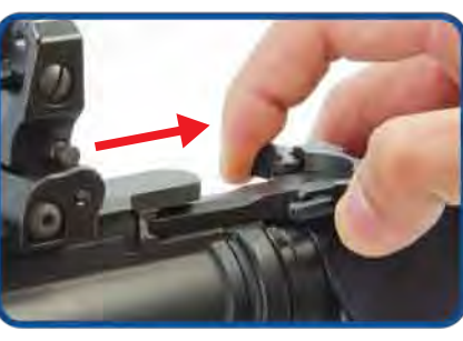
Hold down the button to Pull the Charging Handle.