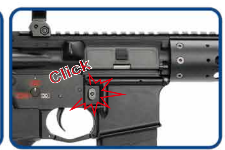
Insert the magazine until you heard a click sound.