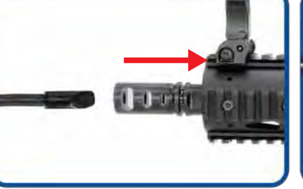
Return the hop up dial to normal position and insert the cleaning rod from the lead edge of the inner barrel.