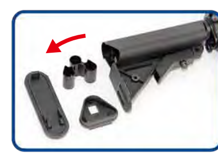
Take out the battery stop.

1. Open the trap door on the top of the BB loader. 2. Load G&G 5.95mm BB pellets into the Magazine