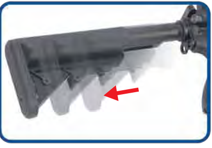
Adjust the position (6 positions).