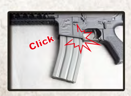
Insert the magazine until you heard a click sound.