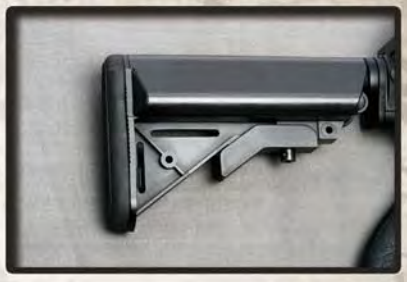
Reinstall the battery cover and butt plate.