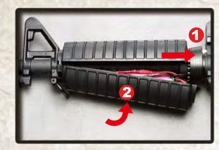
Connect battery plug with the connector.

1. Pull the slip ring and hold. 2. Reinstall the lower handguard.