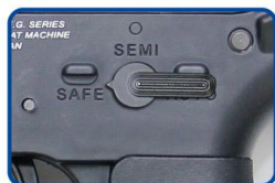
Safety On The gun will not fire