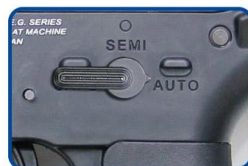
Full Auto Automatic firing