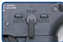
Semi Auto Single shot