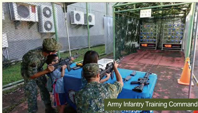
Army Infantry Training Command