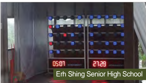
Erh Shing Senior High School