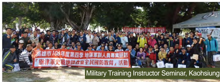
Military Training Instructor Seminar, Kaohsiung