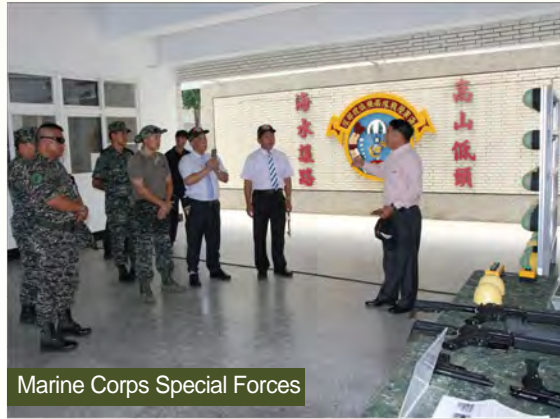
Marine Corps Special Forces