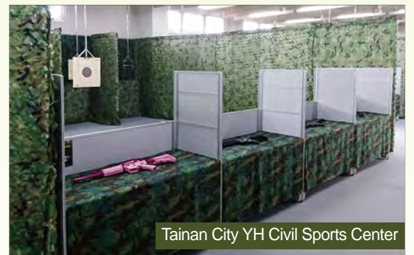
Tainan City YH Civil Sports Center