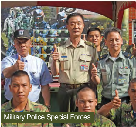
Military Police Special Forces