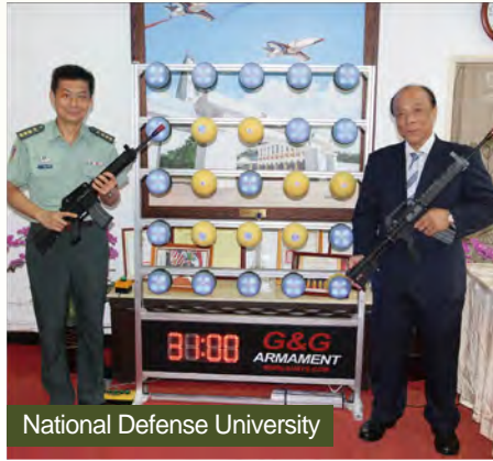
National Defense University