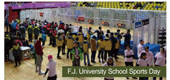
F.J. University School Sports Day