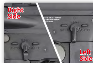
08 Use selector switch to select firing mode: Semi Auto