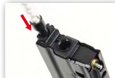
04 Load BB pellets