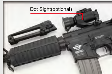
You can buy other accessories to install on the rail system.