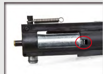
Apply silicone oil in the area circled in red.