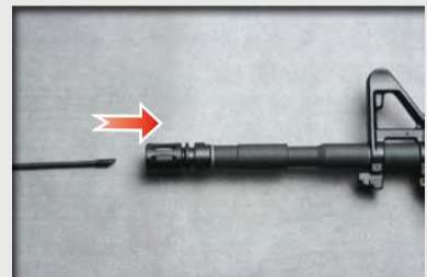
Return the hop up dial to normal position and insert the cleaning rod from the lead edge of the inner barrel