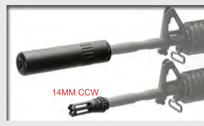
G-SCAR-SD Mock Silencer & Flash Suppressor Material:Steel Model No : G-01-021 Original(Black) Model No : G-01-022 US Type (Black)