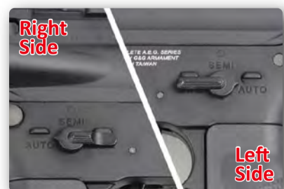
09 Use selector switch to select firing mode: Full Auto