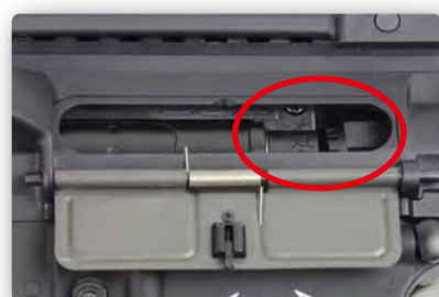
10 Bolt caught when magazine is empty. Reload BBs into magazine and release dummy bolt before fire.