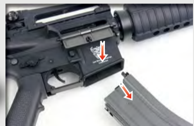
Remove the Magazine