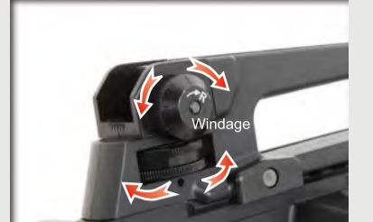
Windage knob: for Rear Sight left / right adjustment. Elevation knob: for Rear Sight up / down adjustment.