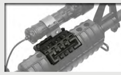
Tactical handguard rail Model No:G-03-095 Material:Plastic