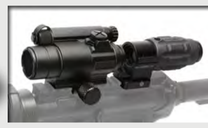
M4 Dot Sight(left) Model No:G-12-011 3X MAG (right) Model No:G-12-012 Material: Metal & Glass