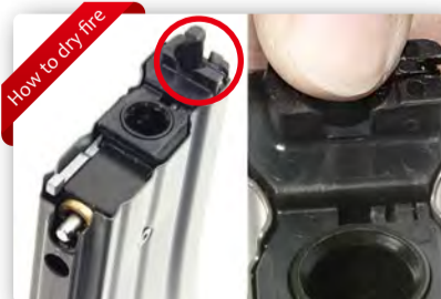
11 Push and hold down the plunger