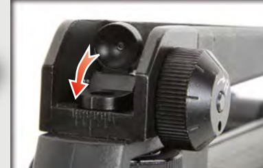
For precision shooting

WARNING : Keep the Selector on Safe mode until you are actually ready to shoot.