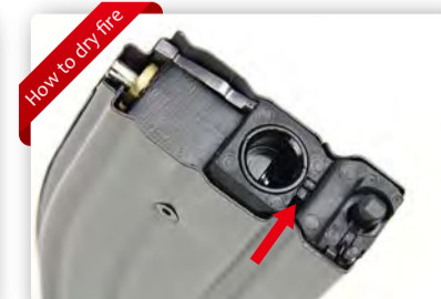
13 Once the plunger is locked, this magazine is able to dry fire.