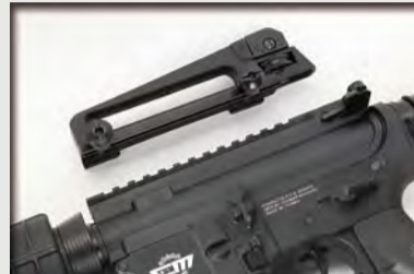
Take off the carrying handle