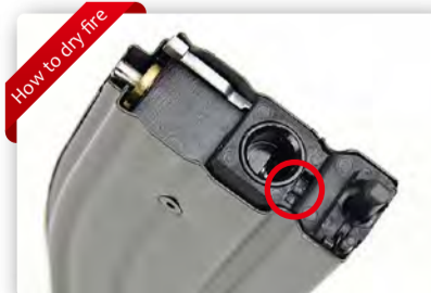
12 Push the plunger locker on the left side of the gas nozzle by using flat head screw driver.