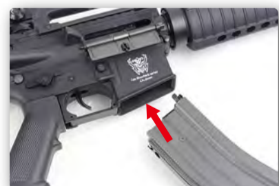
05 Insert the magazine