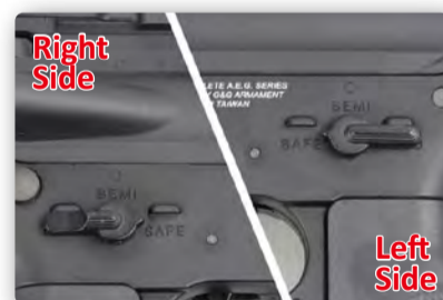
07 Use selector switch to select firing mode: Safety. Pull charging handle to unlock trigger