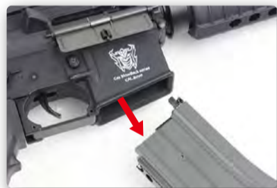
02 Remove the magazine