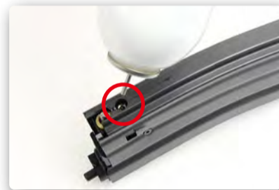
03 Fill magazine with gas