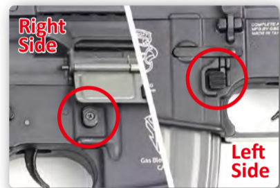
01 Press the magazine release button (Left or Right Side)