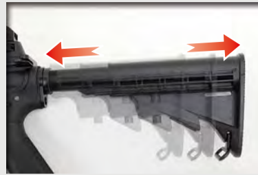
6 position retractable stock