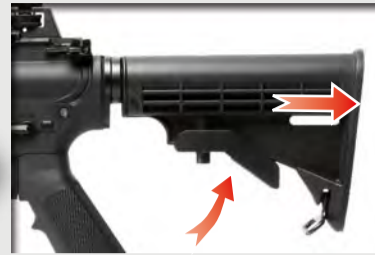
To unlock the stock, press stock release lever and change the position