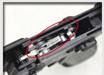
Apply household oil in the area circled in red.