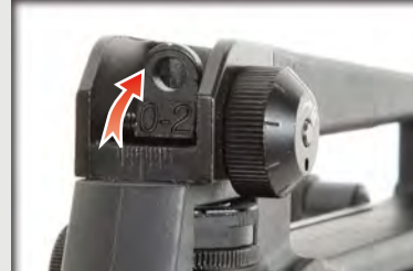
For normal shooting