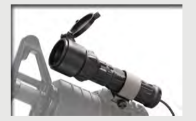
Combat-Lite GPL6 Tactical Pack Model No:G-04-025 Material:Plastic & Metal