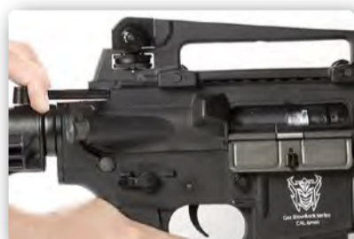
06 Pull charging handle all the way and release